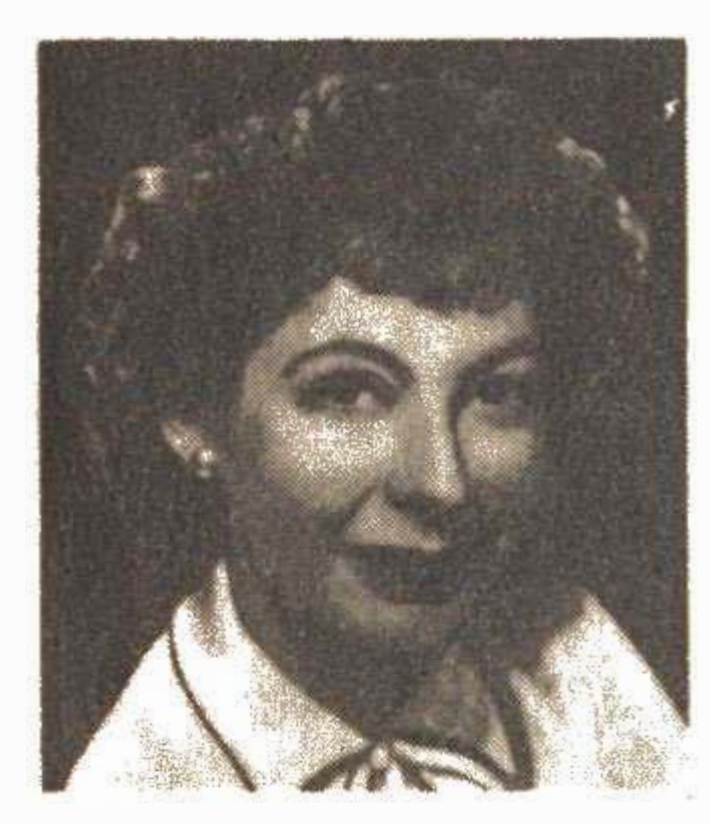
ILKA CHASE, actress and author. 'If mystery magazines were given batting averages, ELLERY QUEEN'S MYSTERY MAGAZINE would bat .400."