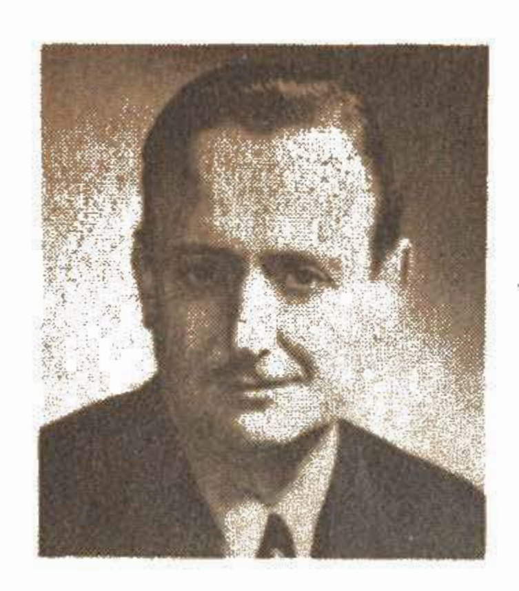
JOHN DICKSON CARR, famous mystery writer. "What I look for is not a clumsy concoction of boy-meets-girl-with-detective-incidents, but a detective story with an original idea. That's what I find in every issue of ELLERY QUEEN'S MYSTERY MAGA-ZINE. That's why I think EQMM is the best detective magazine in the business."